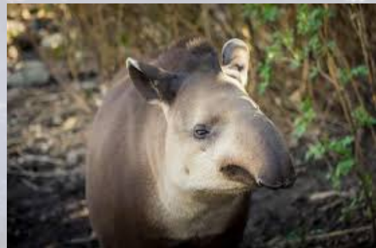
Tapir with a funny nose